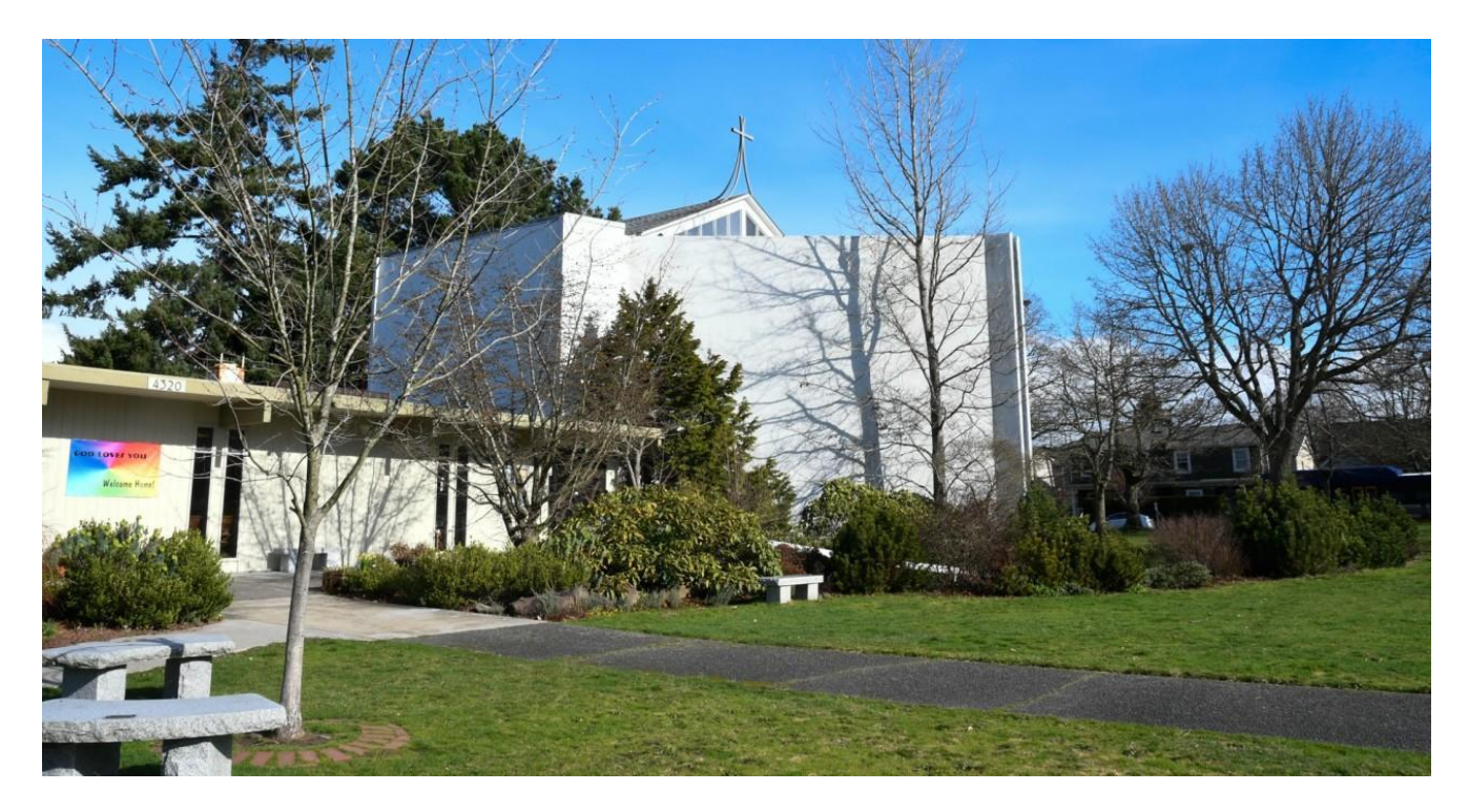
CELEBRATE THE ADMIRAL CHURCH!

1899. A small group of hardy residents of the North Admiral area of West Seattle join together to form West Seattle Congregational Church.